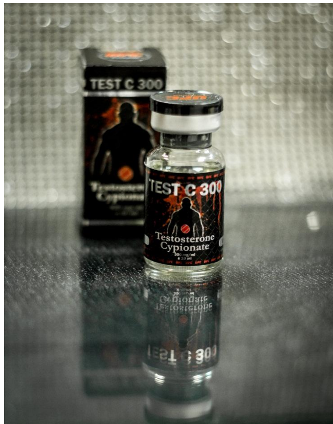
Pic. 1 – Sample appearance.